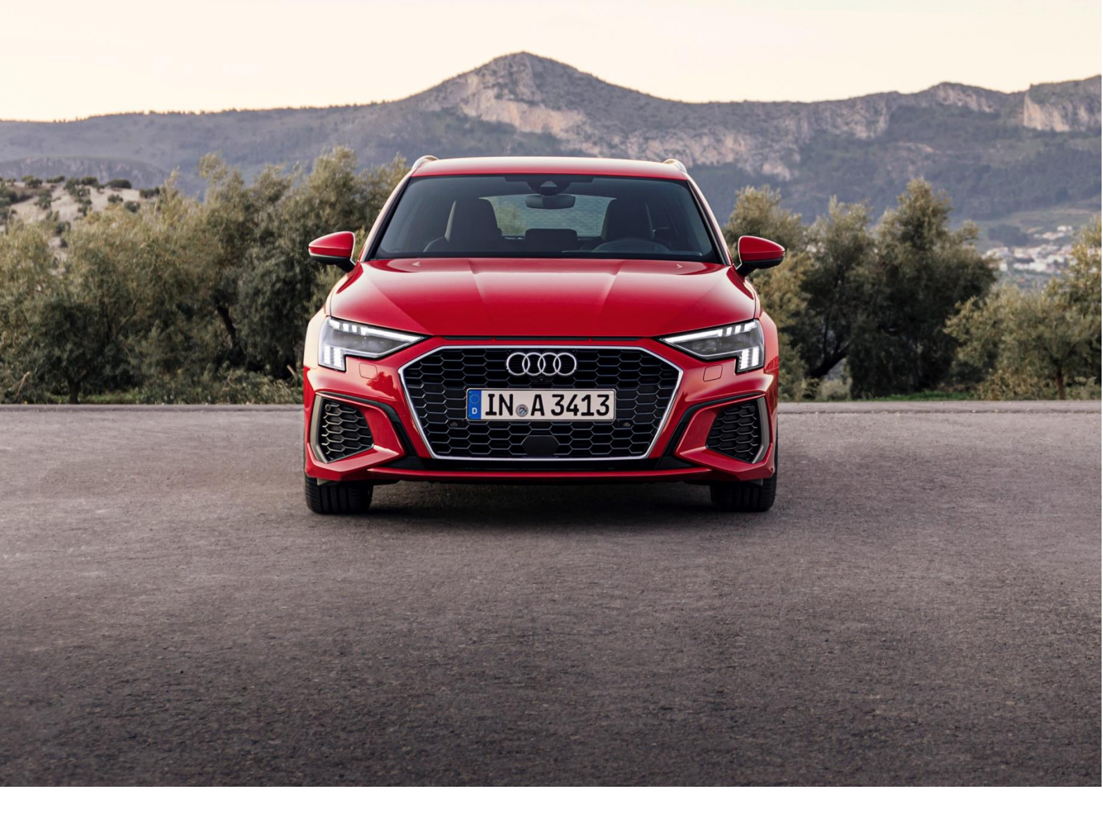
Image shows vehicle from the production year 2020 with optional equipment