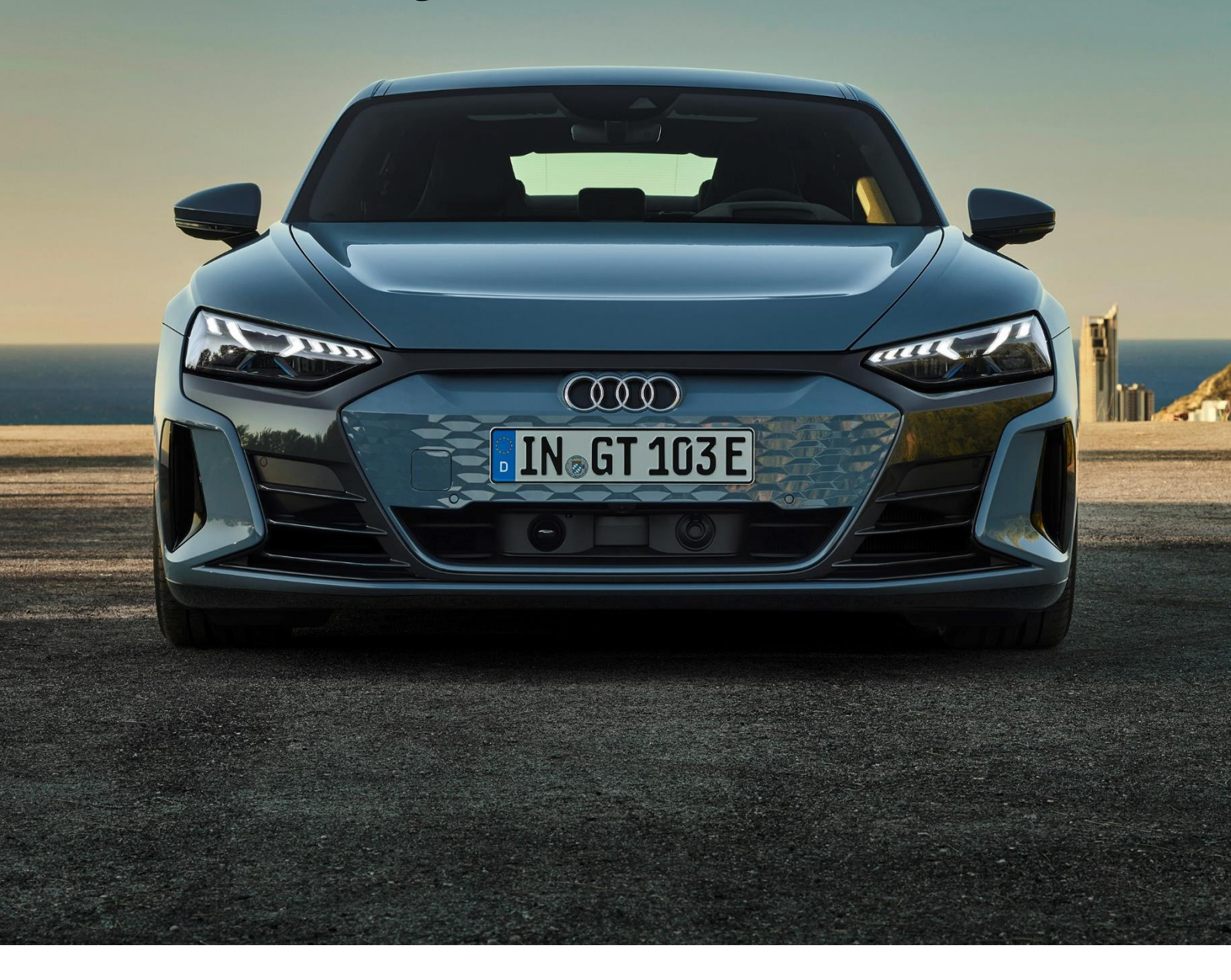
Image shows vehicle from the production year 2020 with optional equipment