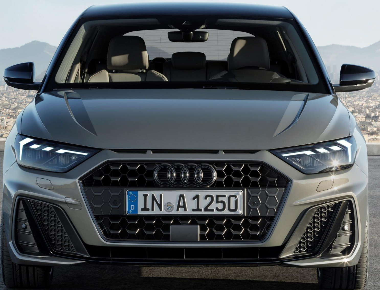
Image shows vehicle from the production year 2018 with optional equipment

* Audi A1 Sportback 25 TFSI, manual transmission, 70 kW: combined fuel consumption: 4.8-4.7 l/100 km (NEDC) or 5.9-5.5 l/100 km (WLTP) ; combined CO 2 -emissions: 111-107 g/km (NEDC) or 134-124 g/km (WLTP)