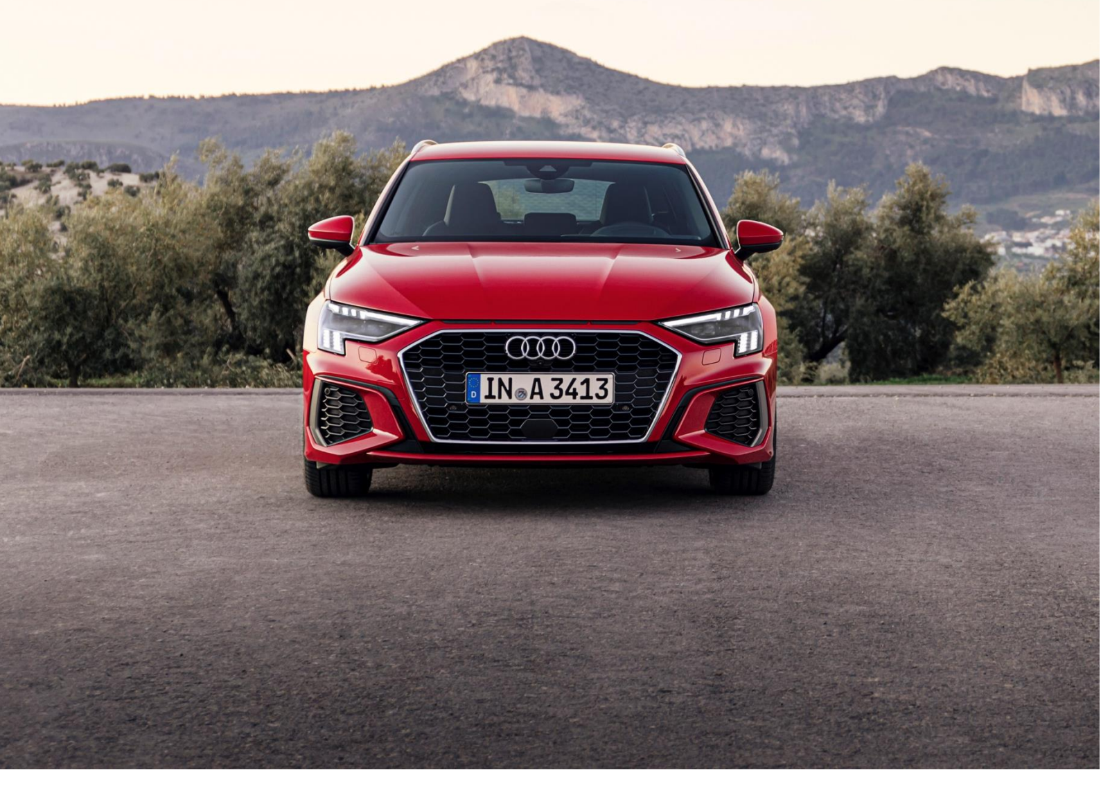
Image shows vehicle from the production year 2020 with optional equipment

* Audi A3 Sportback 35 TFSI S tronic, 7-speed S tronic, 110 kW: combined fuel consumption: 6.2 – 5.6 l/100 km; combined CO<sub>2</sub>-emissions: 141