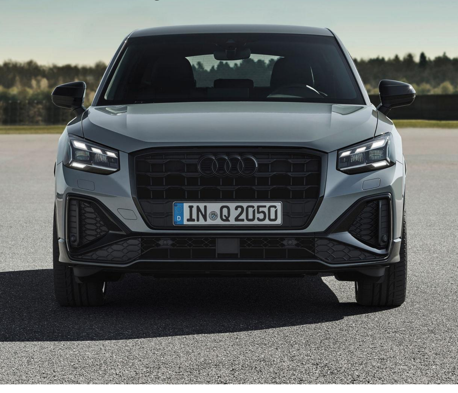
Image shows vehicle from the production year 2020 with optional equipment

* Audi Q2 30 TDI S tronic, 7-speed S tronic, 85 kW: combined fuel consumption: 4.2-4.1 l/100 km (NEDC) or 5.2-4.7 l/100 km (WLTP); combined CO<sub>2</sub>-emissions: 111-107 g/km (NEDC) or 136-124 g/km (WLTP)