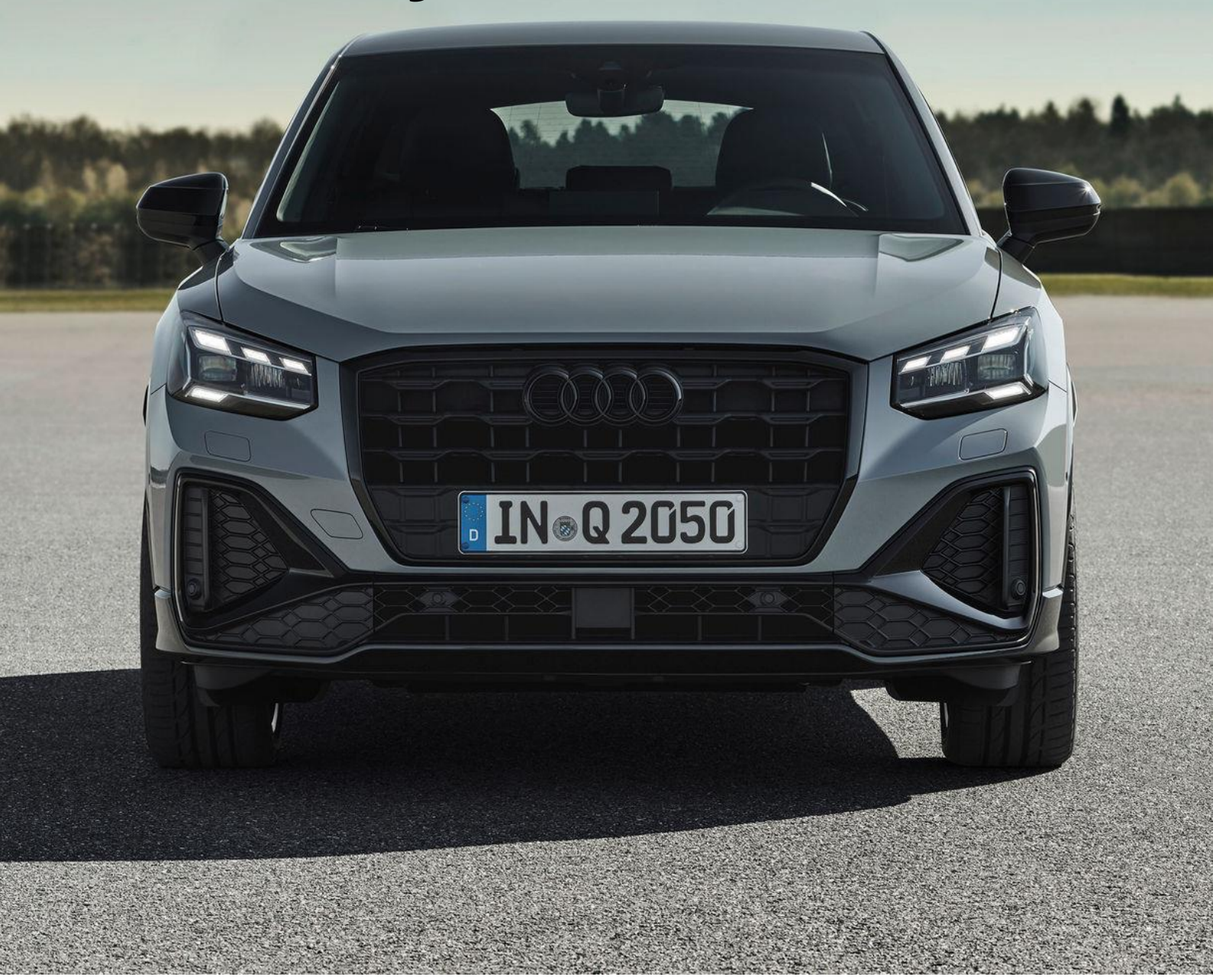
Image shows vehicle from the production year 2020 with optional equipment