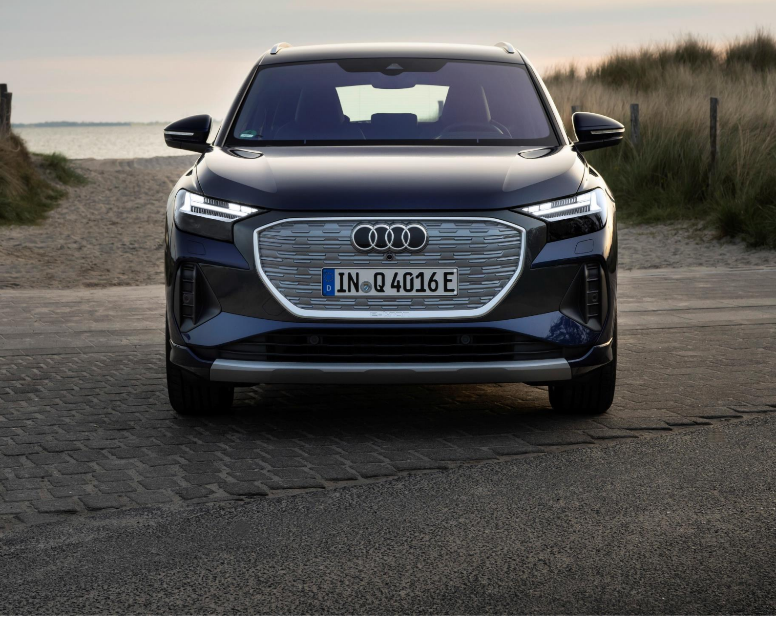
Image shows vehicle from the production year 2021 with optional equipment

* Audi Q4 40 e-tron: combined electric power consumption in kWh/100 km: 19.6 - 16.6 (WLTP) ; combined CO<sub>2</sub>-emissions in g/km: 0 (WLTP) . Consumption and emission values are only available according to WLTP and not according to NEDC for these vehicles.