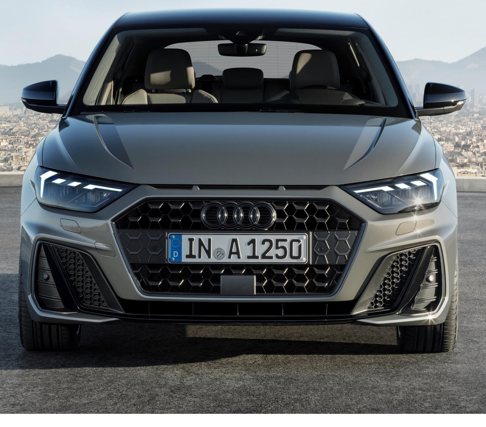
Image shows vehicle from the production year 2018 with optional equipment

* Audi A1 Sportback 25 TFSI, manual transmission, 70 kW: combined fuel comsumption: 5.7 – 5.3 l/100 km; combined CO<sub>2</sub>-emissions: 129 - 120 g/km; CO<sub>2</sub> class: D