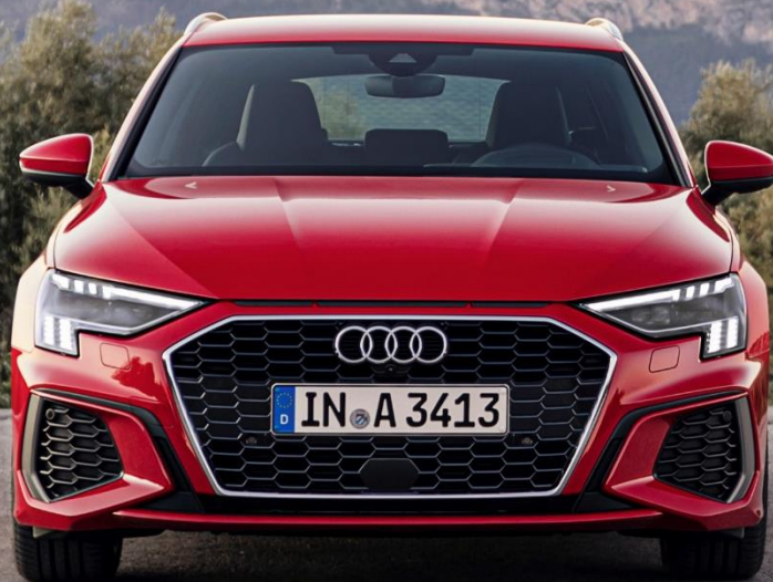
Image shows vehicle from the production year 2020 with optional equipment

* Audi A3 Sportback 30 TDI, 6-speed manual transmission, 85 kW: combined fuel consumption: 4.1-3.9 l/100 km (NEDC) or 4.8-4.4 l/100 km (WLTP); combined CO 2 -emissions: 107-102 g/km (NEDC) or 126-115 g/km (WLTP)