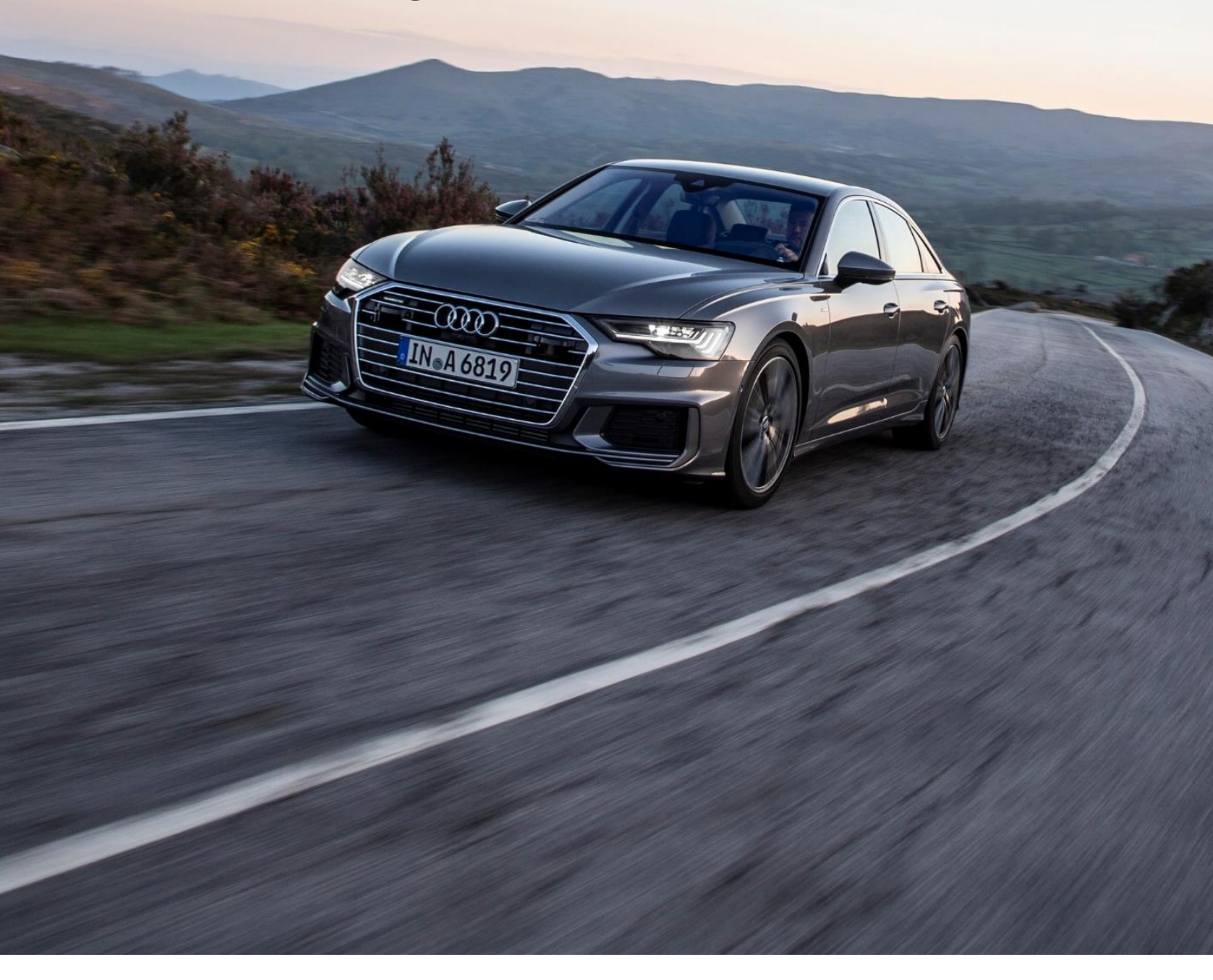
Image shows vehicle from the production year 2018 with optional equipment

* Audi A6 Sedan 50 TDI quattro tiptronic, 210 kW: combined fuel consumption: 6.1-5.9 l/100 km (NEDC) or 6.9-6.3 l/100 km (WLTP) ; combined CO<sub>2</sub>-emissions: 162-155 g/km (NEDC) or 181-164 g/km (WLTP)