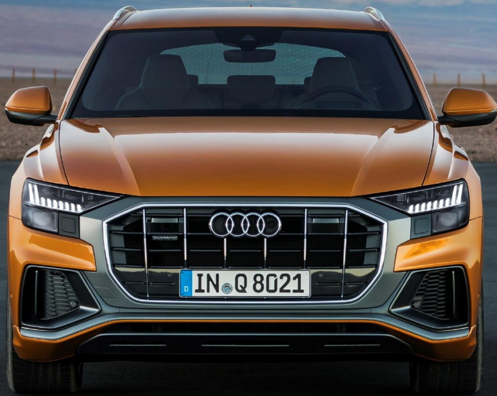
Image shows vehicle from the production year 2018 with optional equipment

* Audi Q8 50 TDI quattro tiptronic, 8-speed tiptronic, 210 kW: combined fuel consumption: 8.9 – 8.8 l/100 km; combined CO 2 -emissions: 232 - 210 g/km; CO 2 Class: G